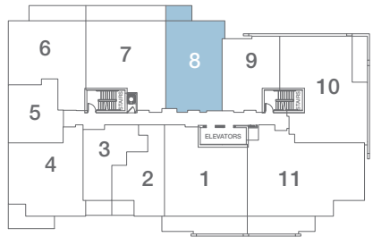
Lower Typical Floors A