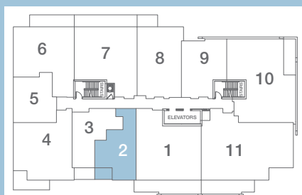
Lower Typical Floors A