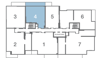
Upper Typical Floor

UPPER 04 | TWO BEDROOM LOWER 05 | 953 SQ. FT. 188 SQ. FT. BALCONY