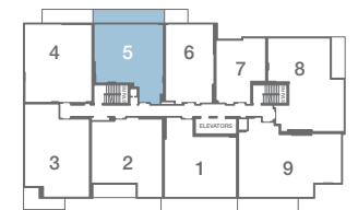
Lower Typical Floor