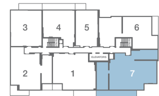
Upper Typical Floor